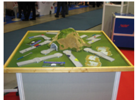
Exhibit on the stand of Borchert + Moller GmbH & Co. KG

For further information, visit: www.OundS-messe.de