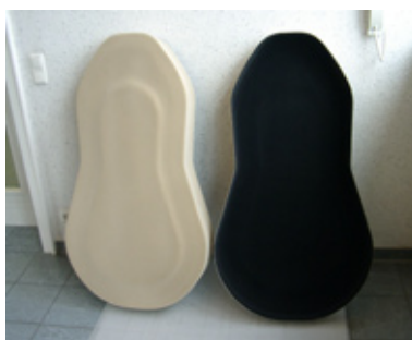
Flocked Carbon Case

do it again at any time, what he learned about Flock during the last years showed him that it is worth to be committed to something. And Flock is SUPER!