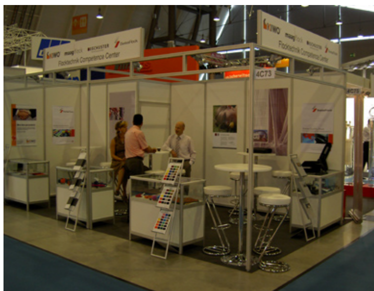
Members of the Association exhibit at O&S, KIWO, Schuster, Swissflock und Maagflock