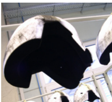
Flocking in the automatised line

Schuster is now investing again into a proprietary development. A robot which will be used in the first place for big pieces to be flocked. It is supposed to minimize the handicap of the workers by flocking. His answer to the question, if